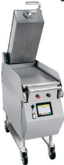
Model G828 Includes grooved upper platen.