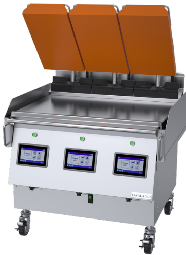
Model XPE36 Shown with low-profile grease cans