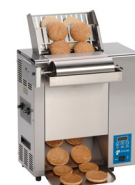
VCT-2000 with Butter Wheel