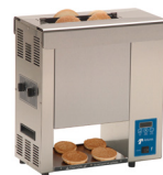
VCT-2000 with Heated Base and Back Plate

*Toast time will vary depending on power frequency