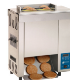
VCT-2000 with Wide Mouth