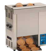
VCT-2000 with Heated Base