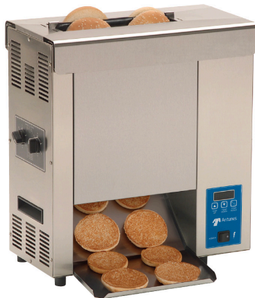
VCT-2000 Vertical Contact Toaster

The Vertical Contact Toaster gives buns a consistent, golden brown finish which helps the sandwich stay firm and delicious. Additional products for the unit include a wide mouth bun feeder, motorized butter wheel, heated base, and back plate. The VCT-2000 features a digital controller for making precise adjustments to the quality of the toast for different bread products.